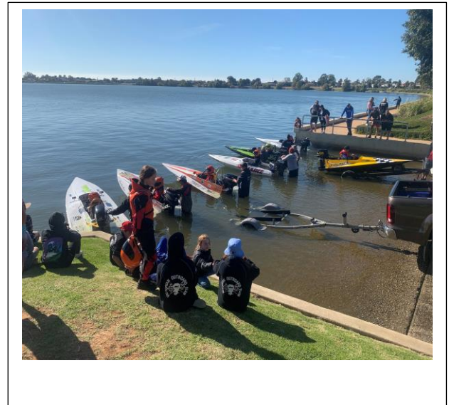
Formula Future Lineup – Yarrawonga April 2021