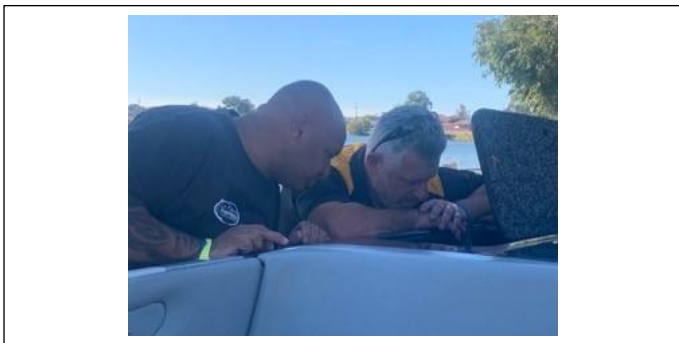
These 2 junior drivers were looking for answers?