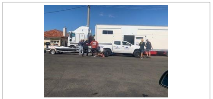
Some Junior Boats have very BIG Transporters!